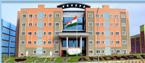
Department of Computer Science and Engineering National Institute of Technology Andhra Pradesh, India